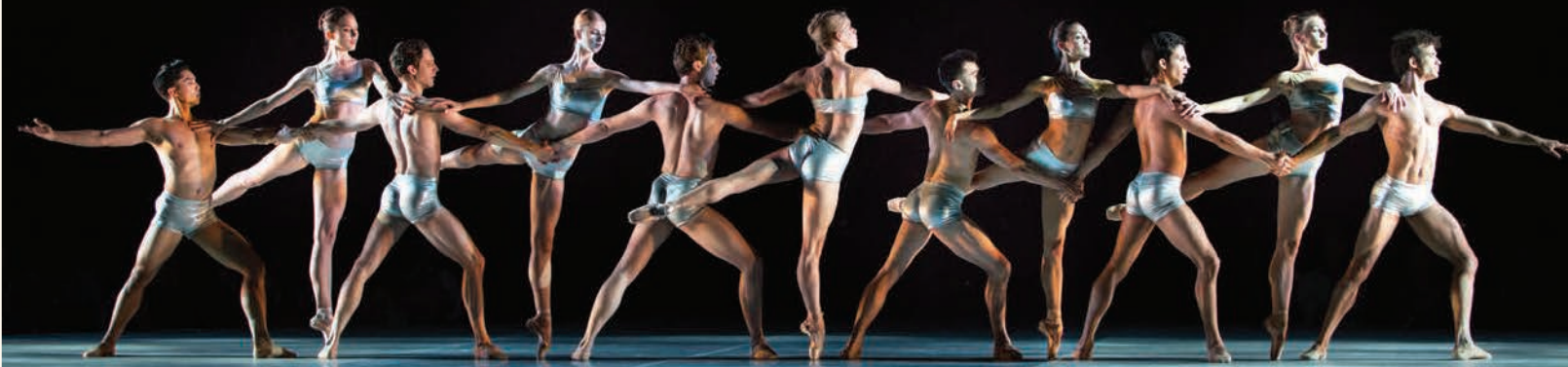
Ballet Arizona dancers in Round .