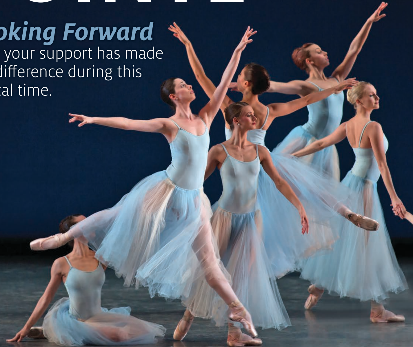
Ballet Arizona dancers in George Balanchine's Serenade.

Looking Forward How your support has made the difference during this critical time.