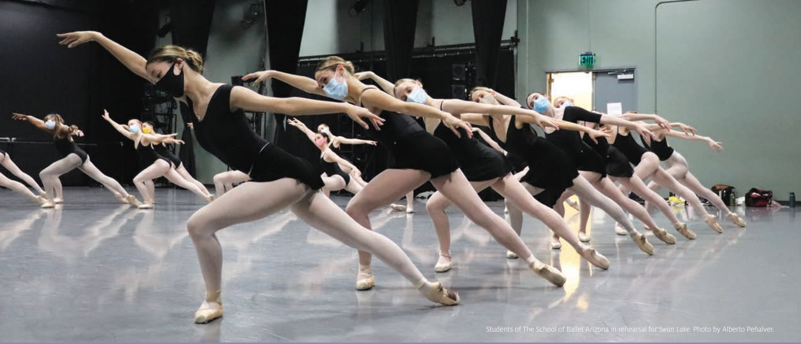
Students of The School of Ballet Arizona in rehearsal for Swan Lake .