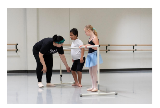
Adaptive Dance for Down

This program facilitates inclusivity between the Native American community, Ballet Arizona and The School of Ballet Arizona.